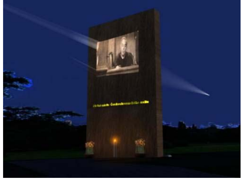
Czechoslovak exiles exhibit