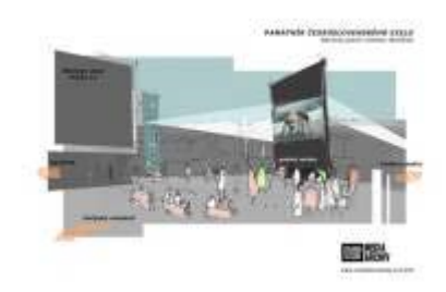
Czechoslovak exiles exhibit